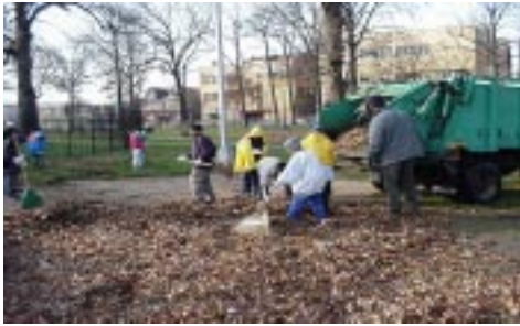
Fall 1999 Clean Up Day

If you ask anyone in downtown Jamaica, Queens to describe Rufus King Park, the adjective “overused” is often employed. The only green